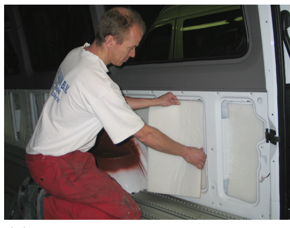
Akotherm in a van

We can manufacture Akotherm in any desired size or shape, including any cut-aways with our water jet cutter or punching machine. The added costs are returned by faster and simpler installation. Ask us for options and prices!